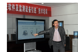
Local training in soft- and hardware usage