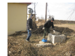
Multiparameter Data-loggers were installed in the Yuncheng region

Yuncheng is located next to the Yellow River in the southwest of the Chinese province of Shanxi. In 20 selected ground water monitoring stations located in Yuncheng's mining areas, multiparameter data loggers are installed and operated continuously to this day.